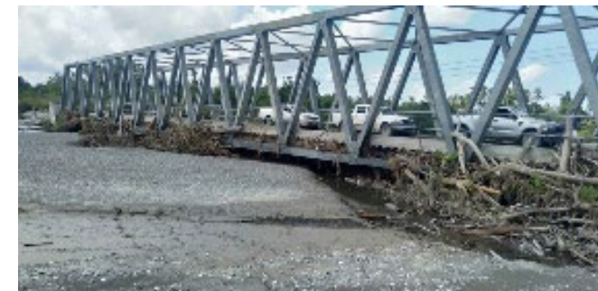
Heavy sedimentation under bridge