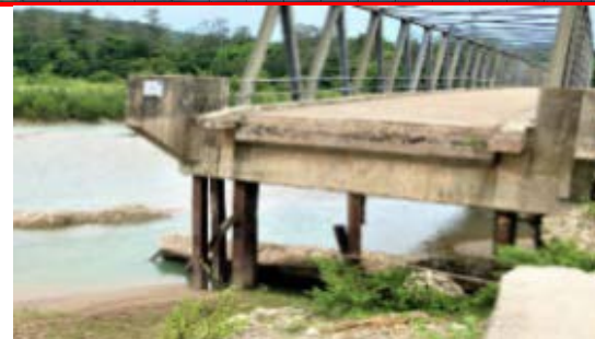
Bridge approach was washed out