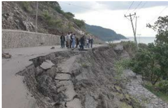
Fill Slope Failure